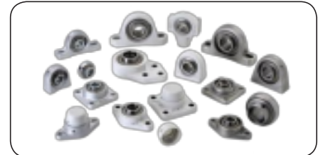
Materials include stainless steel, composite (shown).