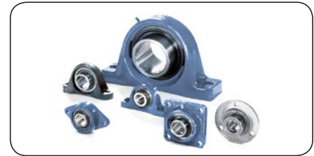
Standard range of housing types: grey cast iron and sheet steel.

Ask about our industry-specific ranges of Y-bearings and Y-bearing units, including the food & beverage and agricultural industries, plus solutions for low friction applications.